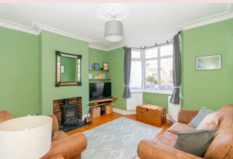
GROUND FLOOR 575 sq.ft. (53.4 sq.m.) approx.

APPROXIMATE FLOOR AREA 103.1 SQM / 1110 SQFT